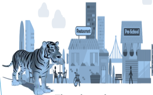
Tiger in a city