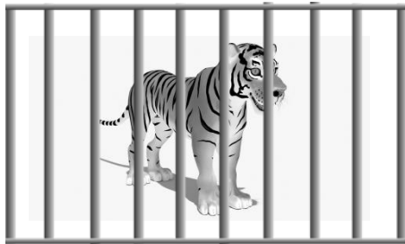
Tiger in a cage