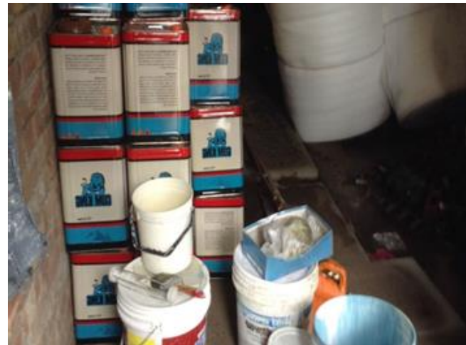
Reference: ZDHC Chemical Management for the Textile Industry, Module 2