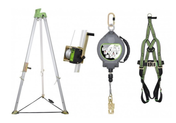
Figure 5: Tripod; winch; full body harness

If the confined space requires vertical entry, and there is not a fixed ladder, a davit arm or a tripod is necessary. A tripod is a recommended for task-specific work such as manhole entry. Tripods easily are set-up by one worker and can be transported from one location to another. One limitation of the tripod is the size of the opening it can accommodate.