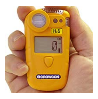
Figure 2: Personal hydrogen sulphide detector

For personal protection personal single gas detector is compact and lightweight yet is fully ruggedized for the toughest of industrial environments. Featuring simple operation, it has a large easy to read display of gas concentration, and audible, visual and vibrating alarms in case of achieving limited concentration of hydrogen sulphide.