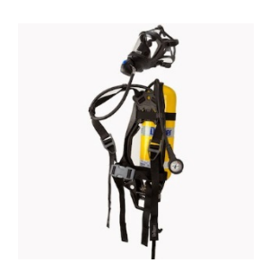
Figure 3: SCBA

SCBA mask provides the wearer a well-equipped environment with fresh air delivered to the mask breathing air from a tank. The air tank, which is under high pressure, usually will provide enough air up to an hour, but a larger version available last longer. This is required under circumstances where there is no safe air supply available, and where the operator must be provided with a safe supply of air to enable them to survive.