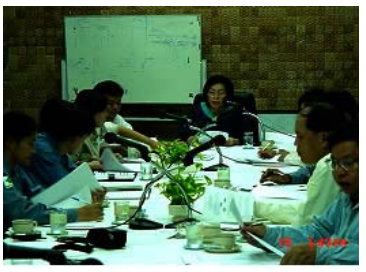
Rayong, Thailand, 2001 Coordination of emergency response