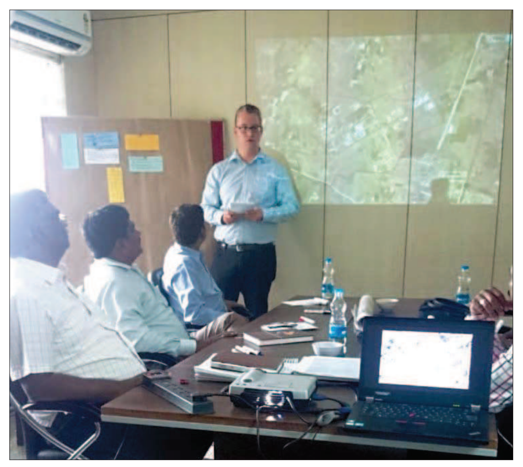
Image no. 1-7: Impressions from two day workshop

As a result of the workshop, the preliminary assessment of the Site Master Plan showed that the site covered several aspects of the DGNB rating system and a formal process of DGNB certification could be initiated targeting silver or higher rating.