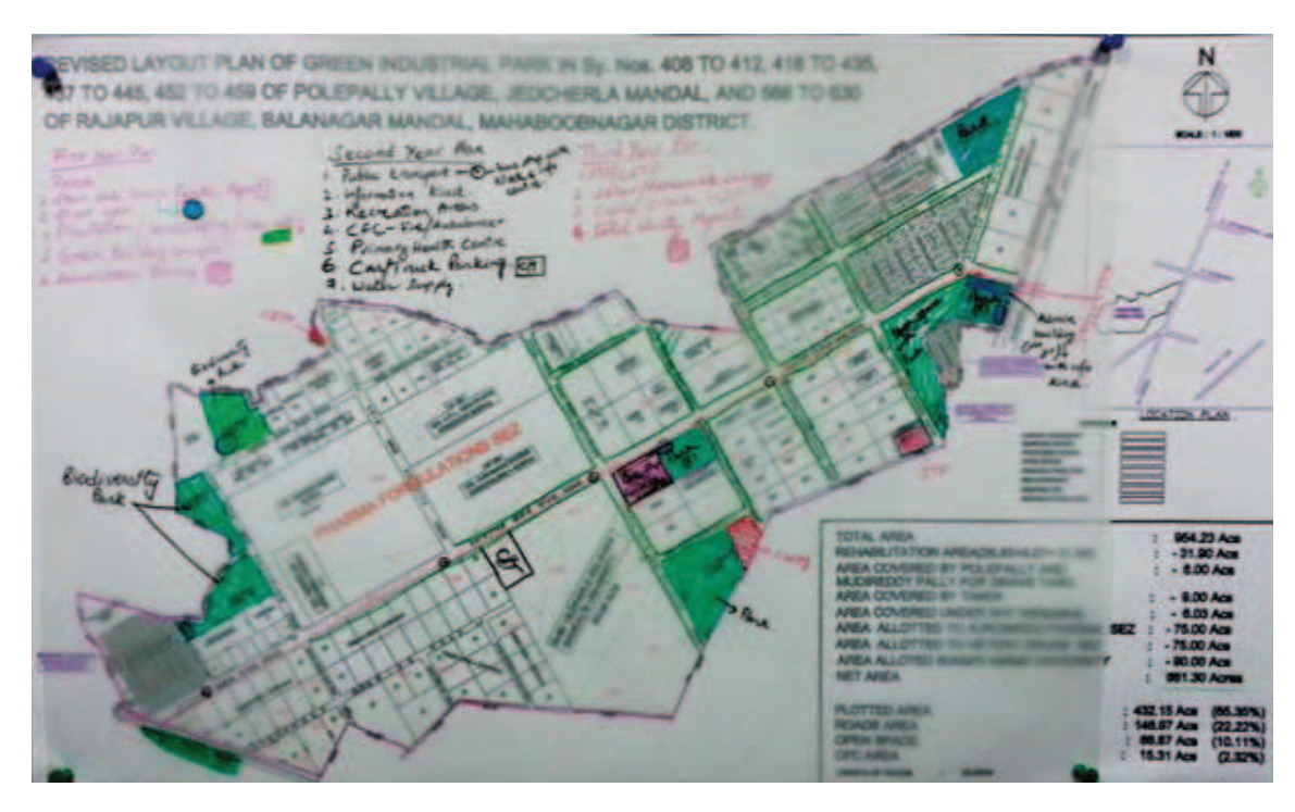
Map no. 1-2: Outcomes of the working group

The trainings led to a deeper understanding of the practical issues of the GIP Jadcherla site and produced applicable recommendations from BuroHappold Engineering, DGNB as well as GIZ-IGEP. (Refer map no. 1-2, table no. 1-2)