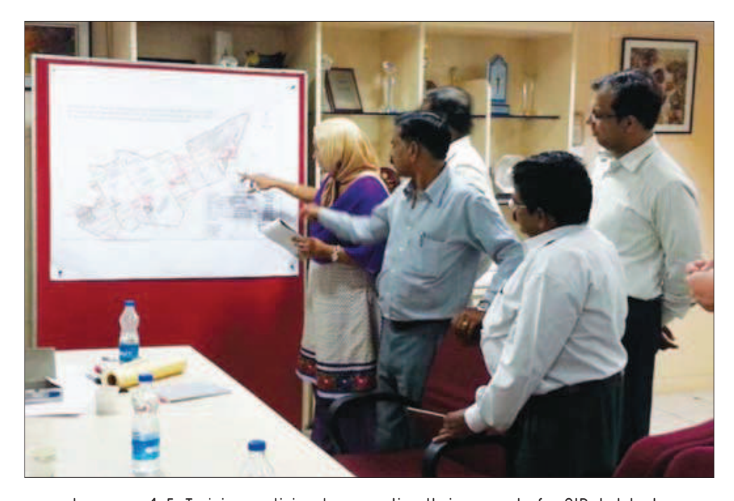
Image no. 1-5: Training participants presenting their concepts for GIP Jadcherla