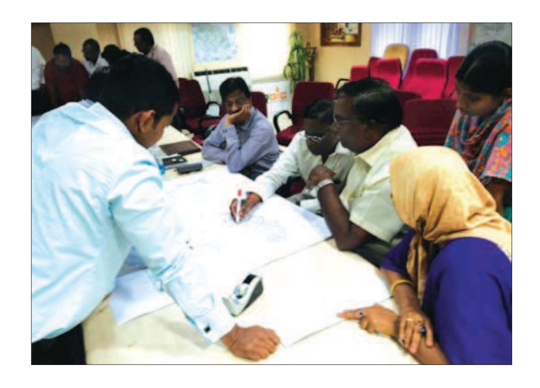
Image no. 1-4: Group-2 marking location of facilities over previous master plan of GIP Jadcherla