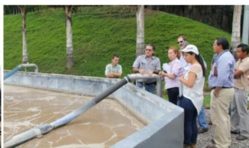
Left: Geothermal System, LaGeo Berlín, El Salvador