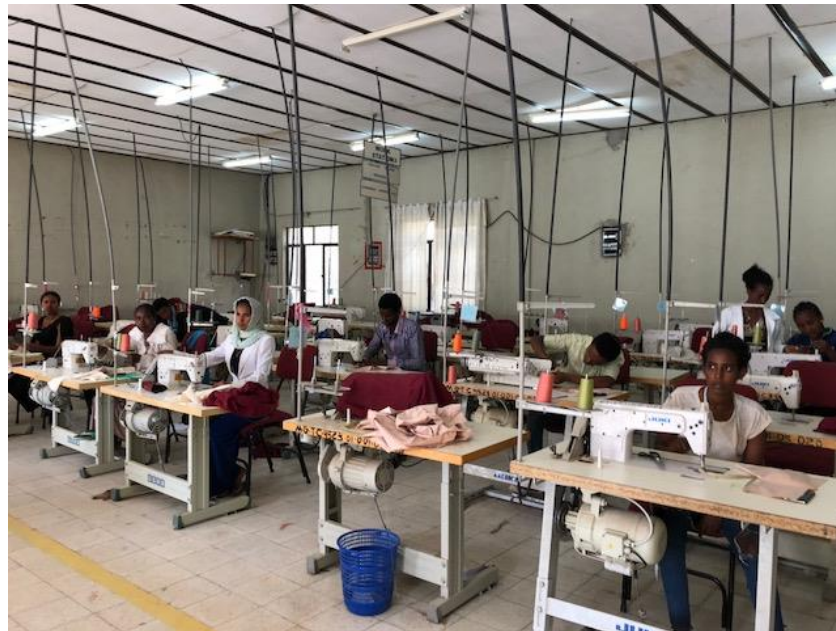
Lack of skilled textile professionals