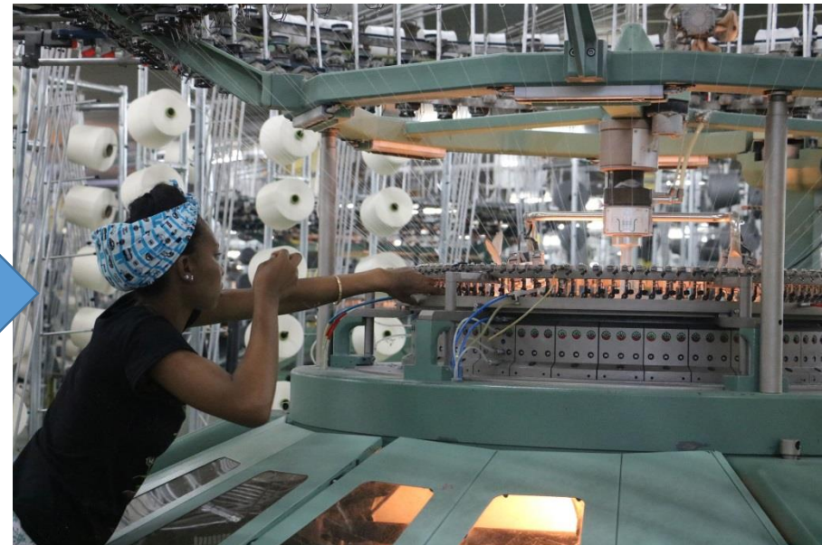
Center of Excellence Strategic Alliance between H&M+DBL+GIZ